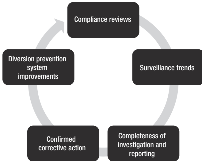
Figure 3. Monitoring and surveillance cycle.

Surveillance. Surveillance processes should be interdisciplinary and touch all aspects of the CS management system, from purchasing, inventory management, administration, waste and disposal, and documentation through expired-product management. CS auditing should be performed on a regularly scheduled basis, as determined by processes in a particular area, such as anesthesia, patient care units, special procedure areas, ambulatory care areas, and the pharmacy, focusing on identified risk points (Figure 1) and previous events. Self-audits should be conducted within areas as well as regularly scheduled audits by individuals external to the area being audited. The organization should periodically audit compliance with all diversion controls, including human resources requirements for individuals authorized to handle CS (i.e., completion of required background checks, documentation of training and competency requirements for authorized HCWs, compliance with licensure board reporting, testing for fitness for duty, random drug-testing requirements, and compliance with rehabilitation program requirements). Important examples of recommended surveillance practices include the following (See Appendix B for additional guidance.):